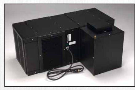
System shown with optional integrated humidifier